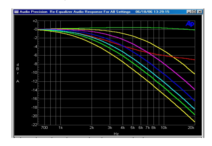
HIGH FREQUENCY ROLLOFF SETTINGS